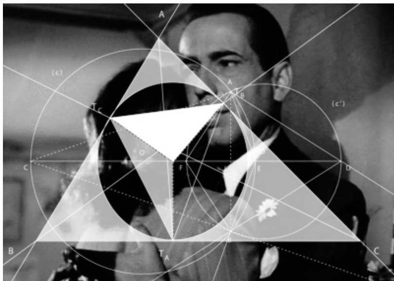
2012, print on baryte paper, 90 x 120 cm. Ed. of 5 + 2 A.P.

Read the text by Régis Durand : A continuous building up. 2014