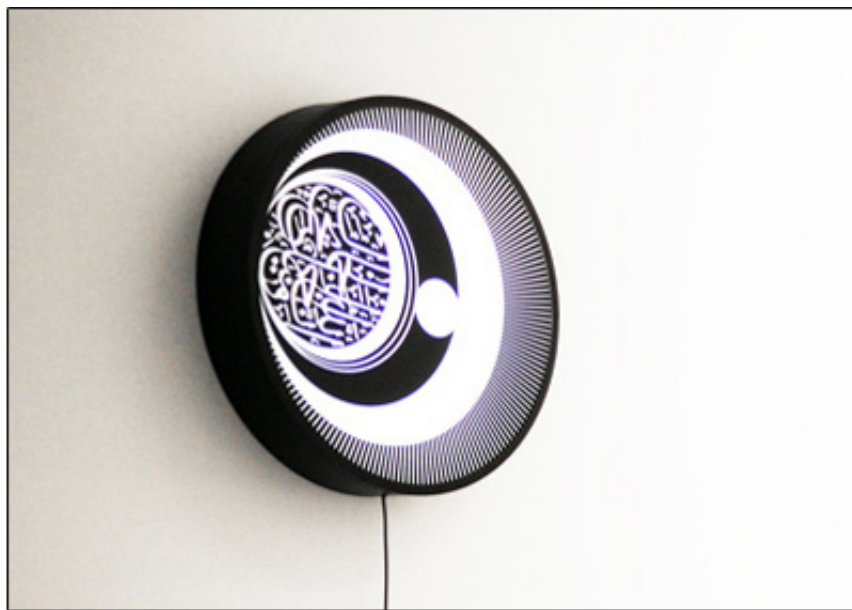
2011, print on Durantrans, lightbox, 75 cm and ink print on Baryté paper, 100cm x 75cm. Exhibition view from Spot On: Mounir Fatmi, Museum Kunst Palast, 2013, Düsseldorf. Ed. of 5 + 2 A.P.

Mêlant des éléments de calligraphie arabe et des motifs géométriques imprimés à l'encre noire sur des supports opalescents et translucides, la série de caissons lumineux Technologia est le début de toute une recherche qui mêle le langage à l'effet optique de l'image et le mouvement de la machine.