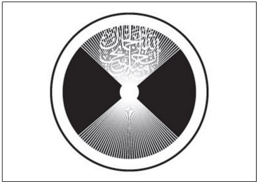
2011, print on Durantrans, lightbox, 75 cm and ink print on Baryté paper, 100cm x 75cm. Ed. of 5 + 2 A.P.