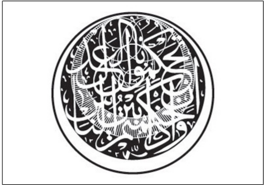
2011, print on Durantrans, lightbox, 75 cm and ink print on Baryté paper, 100cm x 75cm. Ed. of 5 + 2 A.P.