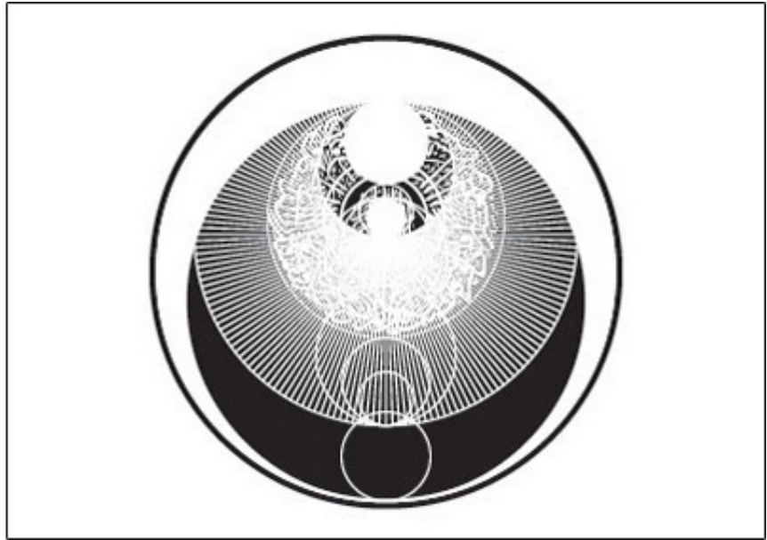
2011, print on Durantrans, lightbox, 75 cm and ink print on Baryté paper, 100cm x 75cm. Ed. of 5 + 2 A.P.