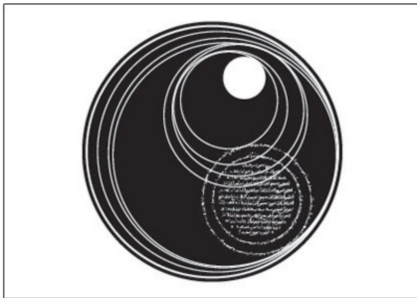
2011, print on Durantrans, lightbox, 75 cm and ink print on Baryté paper, 100cm x 75cm. Ed. of 5 + 2 A.P.