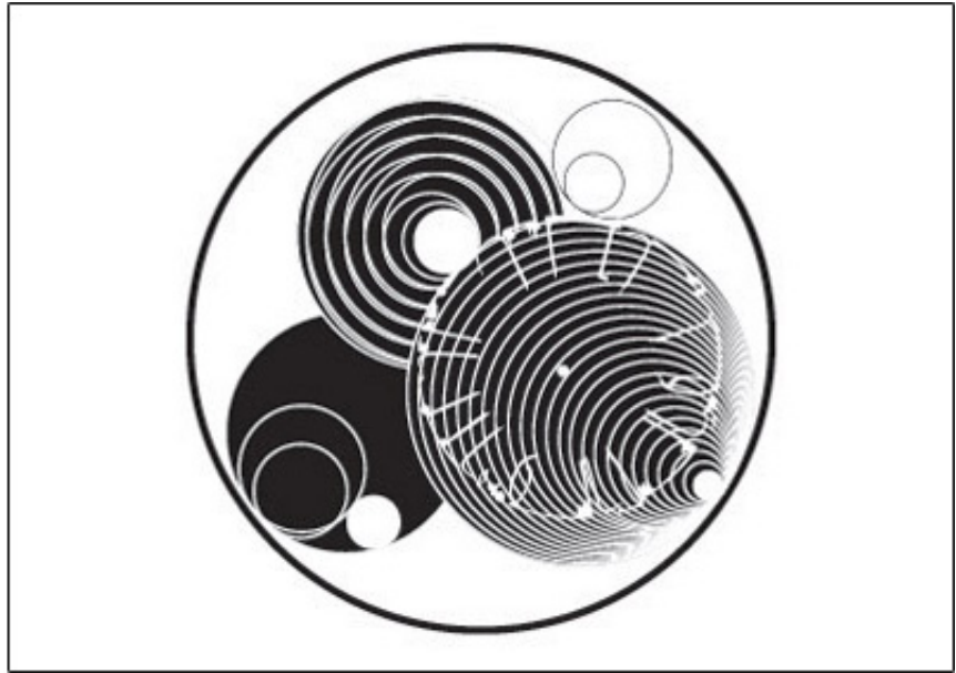
2011, print on Durantrans, lightbox, 75 cm and ink print on Baryté paper, 100cm x 75cm. Ed. of 5 + 2 A.P.