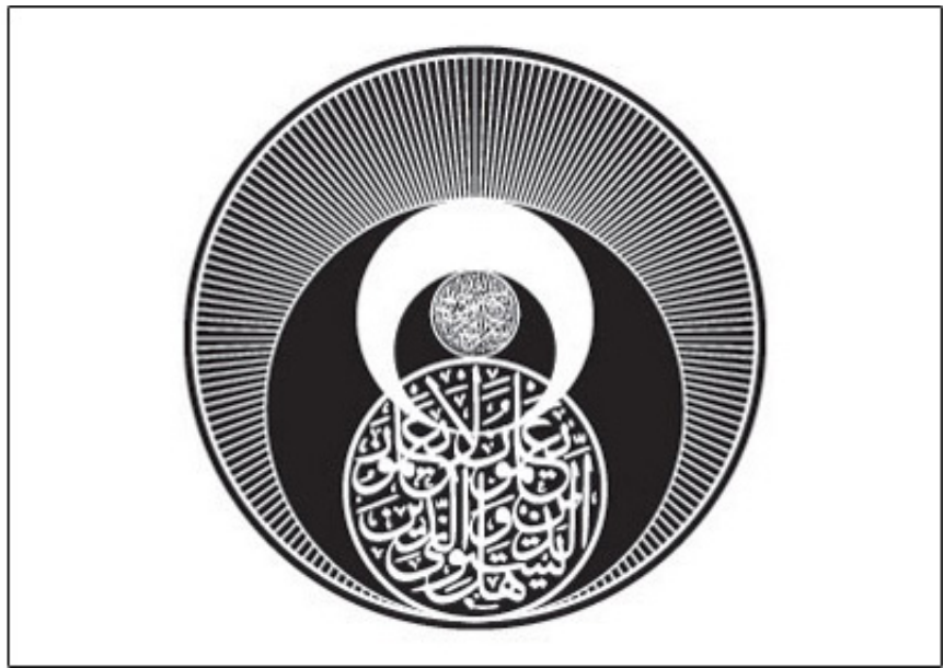
2011, print on Durantrans, lightbox, 75 cm and ink print on Baryté paper, 100cm x 75cm. Ed. of 5 + 2 A.P.