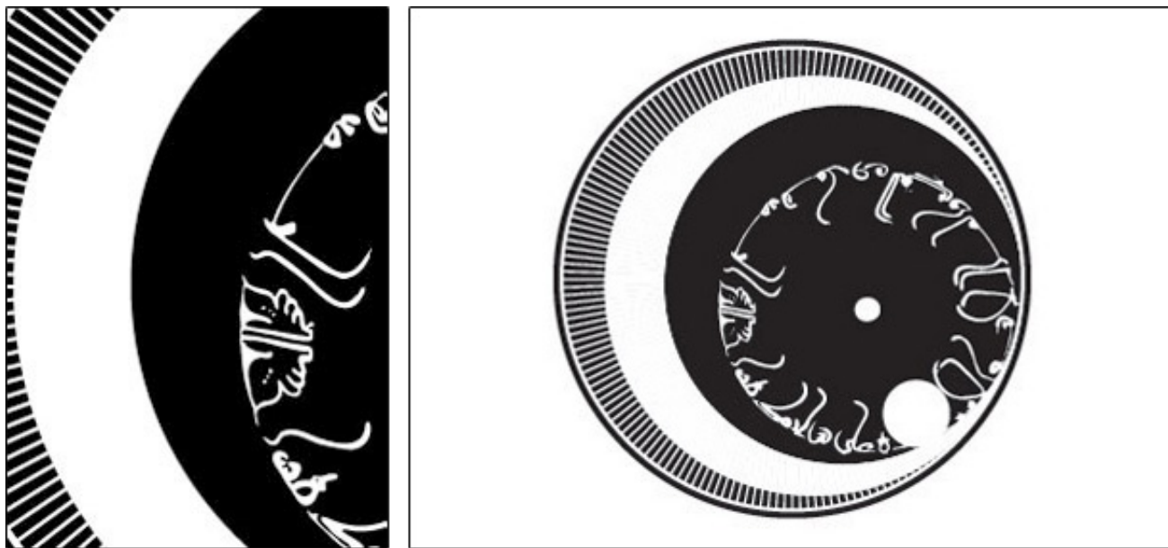
2011, print on Durantrans, lightbox, 75 cm and ink print on Baryté paper, 100cm x 75cm. Ed. of 5 + 2 A.P.