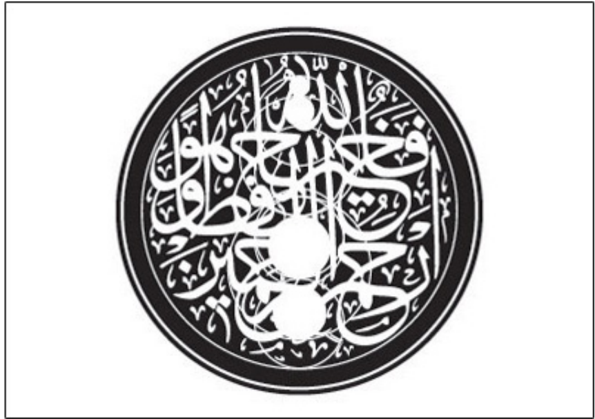
2011, print on Durantrans, lightbox, 75 cm and ink print on Baryté paper, 100cm x 75cm. Ed. of 5 + 2 A.P.