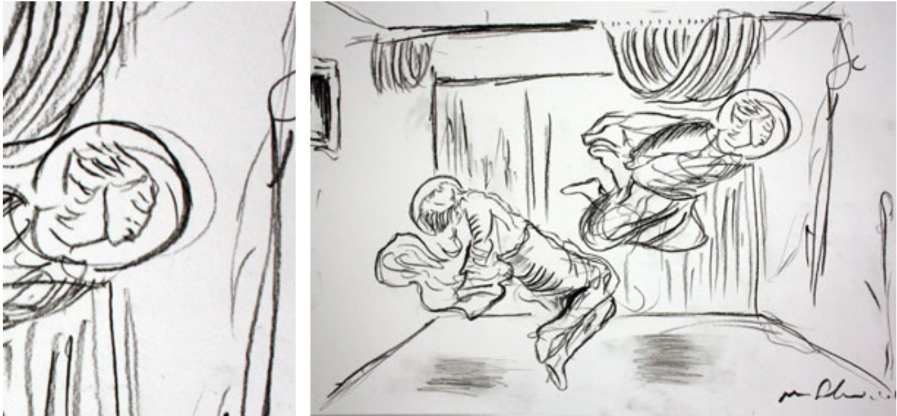
2012, serie of drawings, pencil on paper, 29,7 x 42 cm. Exhibition view from Blinding Light, Analix Forever, 2013, Geneva.

La jambe noire de l'ange est une série de dessins au graphite en noir et blanc de 2012 qui s'inscrivent dans un projet au long cours intitulé La lumière aveuglante, inspiré par un tableau du XVe siècle, « La guérison du Diacre Justinien », par le peintre italien Fra Angelico. Le tableau montre deux saints, Côme et son frère Damien, revenus à la vie pour effectuer une opération chirurgicale, la greffe d'une jambe noire, celle d'un homme éthiopien récemment décédé, sur le diacre. C'est une image frappante, inattendue et rare de voir cette fusion étrange entre le noir et le blanc, le mort et le vivant, le divin et la science. En une seule scène, Fra Angelico remet en question les idées de race, d'hybridation et d'identité. Nés en Syrie, Côme et Damien étaient arabes de naissance et se sont convertis au christianisme lorsqu'ils ont commencé à pratiquer la médecine, une vocation qui leur valut au bout du compte le martyre et la décapitation. Ils sont considérés comme les saints patrons des médecins.