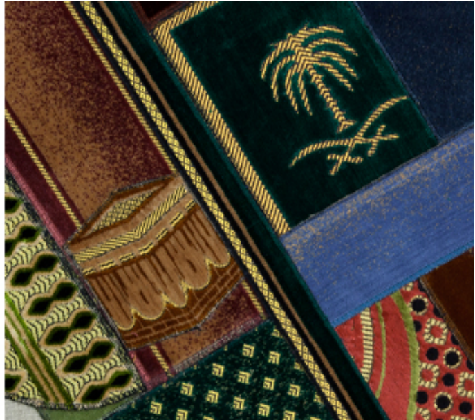
2014-2015, collage with prayer rugs on canvas, 80 x 80 cm. Exhibition view from Art Brussels, Keitelman Gallery, 2015, Brussels.