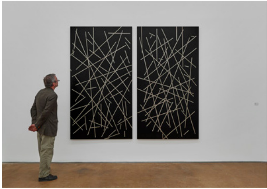
2014- 2015, Diptych, acrylic on wood, 220 x 122 cm each Exhibition view from Permanent Exiles, MAMCO, Geneva, 2015.

Martyrs est une série d'œuvres composée de panneaux de bois sur lesquels sont peintes sur fond noir une multitude de lignes comme les traces de cicatrices sur un corps. Le titre de l'œuvre, Martyrs, joue sur une double définition du terme. Si son acceptation la plus répandue renvoie aux personnages bibliques qui sont allés jusqu'à se laisser tuer en témoignage de leur foi, un martyr est aussi dans le vocabulaire de l'ébénisterie une cale protégeant des coups de marteaux et de scies.