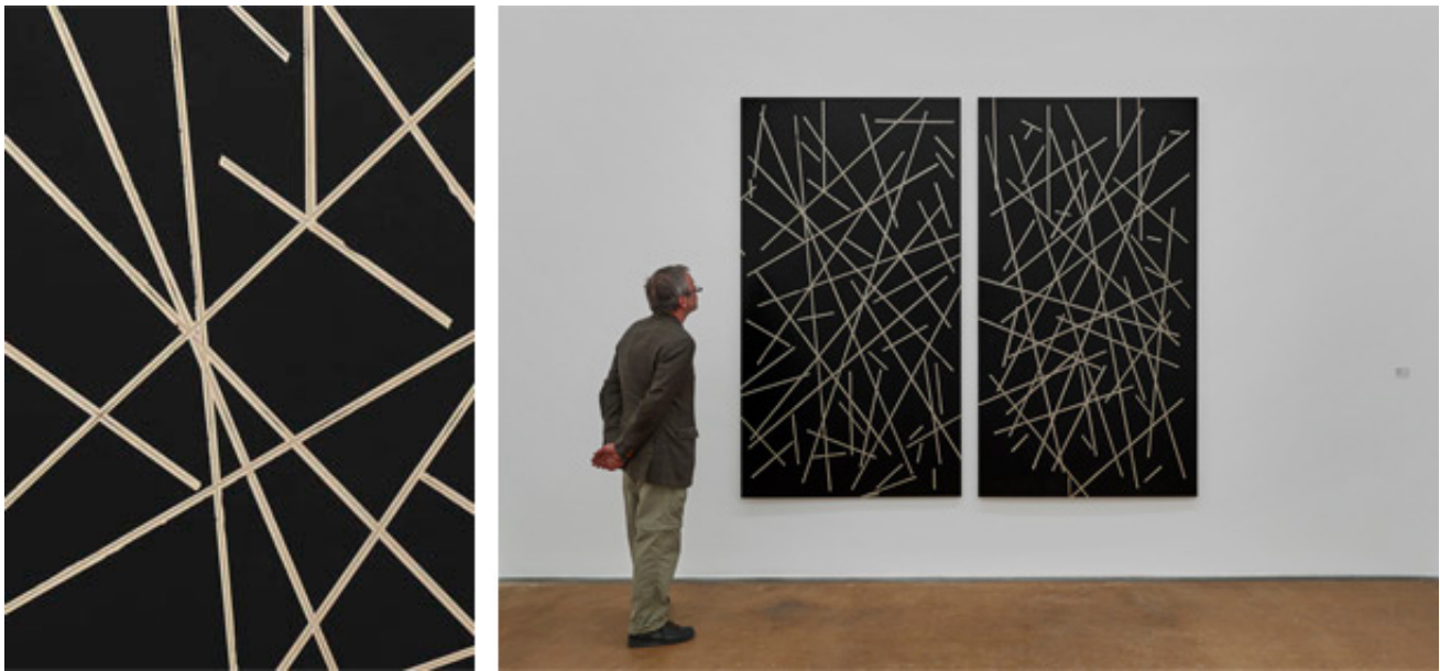
2014- 2015, Diptych, acrylic on wood, 220 x 122 cm each Exhibition view from Permanent Exiles, MAMCO, Geneva, 2015.

Martyrs est une série d'œuvres composée de panneaux de bois sur lesquels sont peintes sur fond noir une multitude de lignes comme les traces de cicatrices sur un corps. Le titre de l'œuvre, Martyrs, joue sur une double définition du terme. Si son acceptation la plus répandue renvoie aux personnages bibliques qui sont allés jusqu'à se laisser tuer en témoignage de leur foi, un martyr est aussi dans le vocabulaire de l'ébénisterie une cale protégeant des coups de marteaux et de scies.