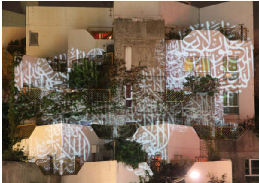
2009, video, France, 30 min, SD, 4/3, B&W, 5 min 26. Size may vary, video projection. Exhibition view from Déreway to Basel, Public space project, 2011, Ivry-sur-Seine.

Fresque lumineuse projetée sur des immeubles d'habitation d'une grande ville, Ghosting se compose d'une série de cercles calligraphiés s'entrecroisant, en rotation plus ou moins rapide dans les sens horaire et antihoraire.