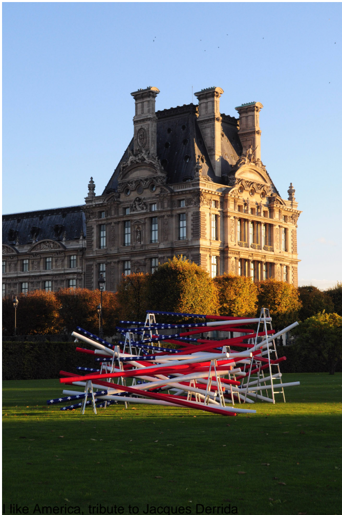
like America, tribute to Jacques Derrida

individuals by the ideas of nation, borders or territory and to overcome these very notions that tend to hinder the possibility of difference and the desire to move about freely.