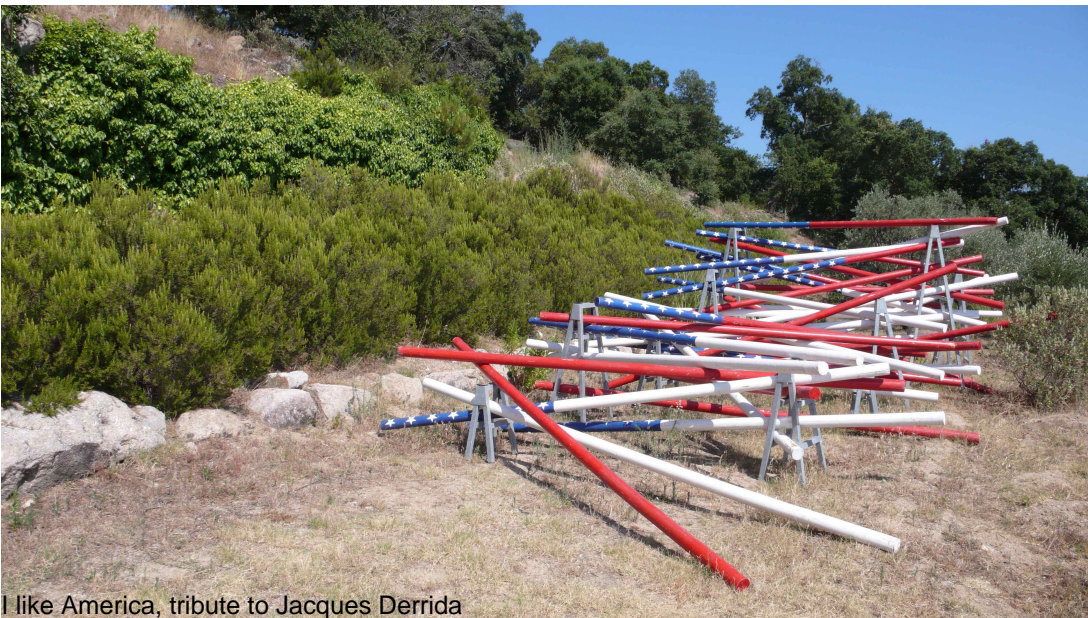
I like America, tribute to Jacques Derrida

Translating these issues spatially, it questions the very foundations of reality by experimenting its power of resistance and mobilizes the viewers' cognitive, intellectual and physical capacities. This piece establishes itself as an obstacle, which in turn is defined as an esthetic strategy elaborated by Mounir Fatmi and developed through several installations using various materials.?