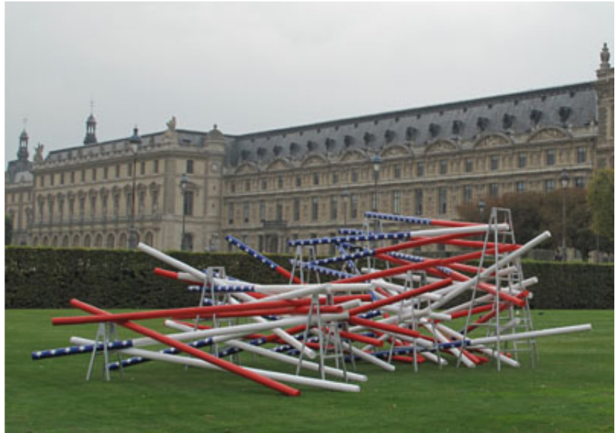
2007, painted jumping poles, ladders in metal, size may vary. Exhibition view from Tuileries, FIAC hors Les murs, 2010, Paris.

L'intervention publique J'aime l'Amérique , hommage à Jacques Derrida fait surgir un enchevêtrement de barres de saut d'obstacle hippique peintes aux couleurs du drapeau américain, au beau milieu du Jardin des Tuileries fréquenté par les promeneurs.